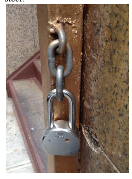
To be a harsh environmental lock it should have:

These padlocks have been developed to protect the lock in harsh environments. For these padlocks to be truly considered "Harsh Environment Padlocks" they must have interior protection also. They come in a variety of security levels from low entry level security all the way to high security with key control. Electronic locks are also being made in stainless steel.