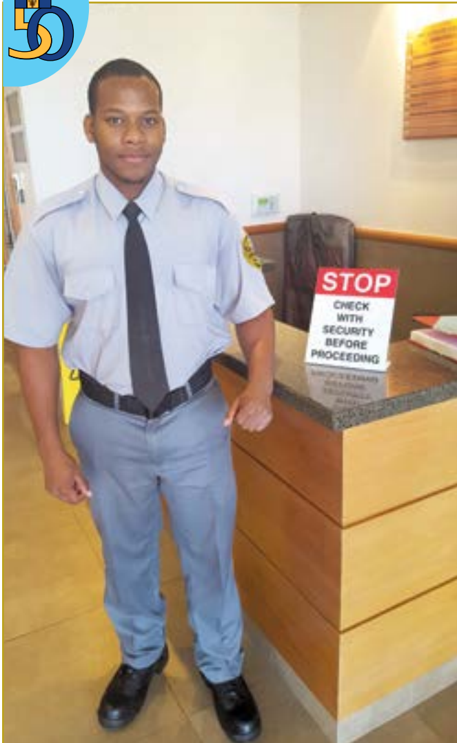
AMALGAMATED SECURITY SERVICES provides the highest quality service which is best suited for its clients.