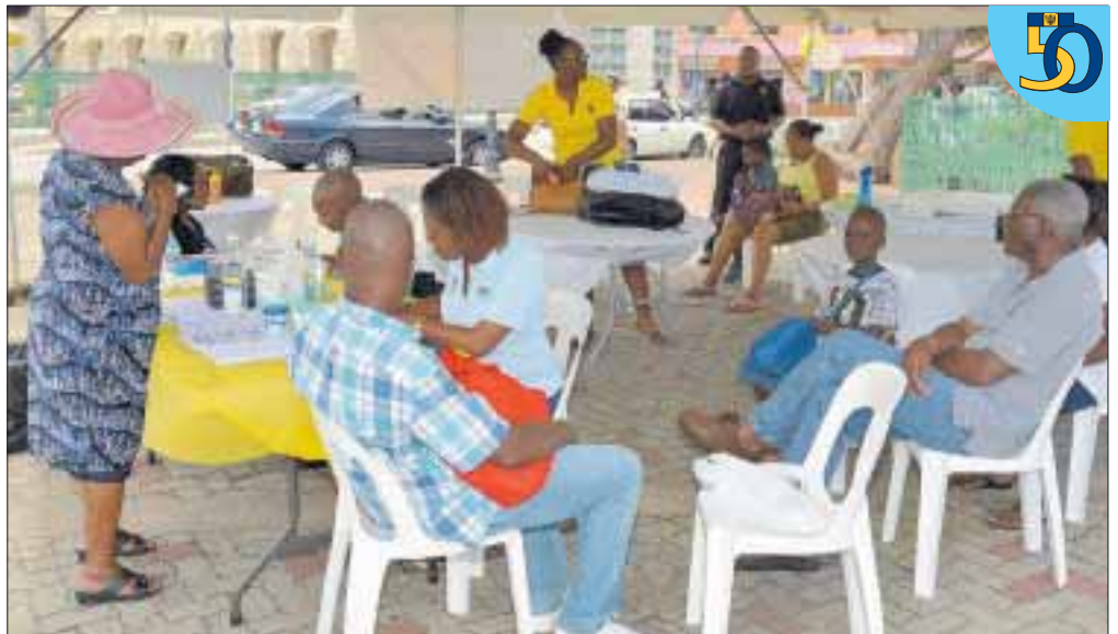
HEALTH CHECKS being done in Heroes Square, The City during Amalgamated Security Services' 10th anniversary week of activities.