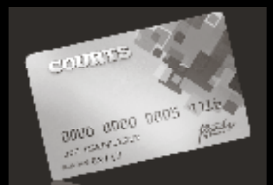
Courts Customer Card accepted at Abed's

Full selection available at both our Bridgetown and Sheraton Mall locations. *some conditions apply.