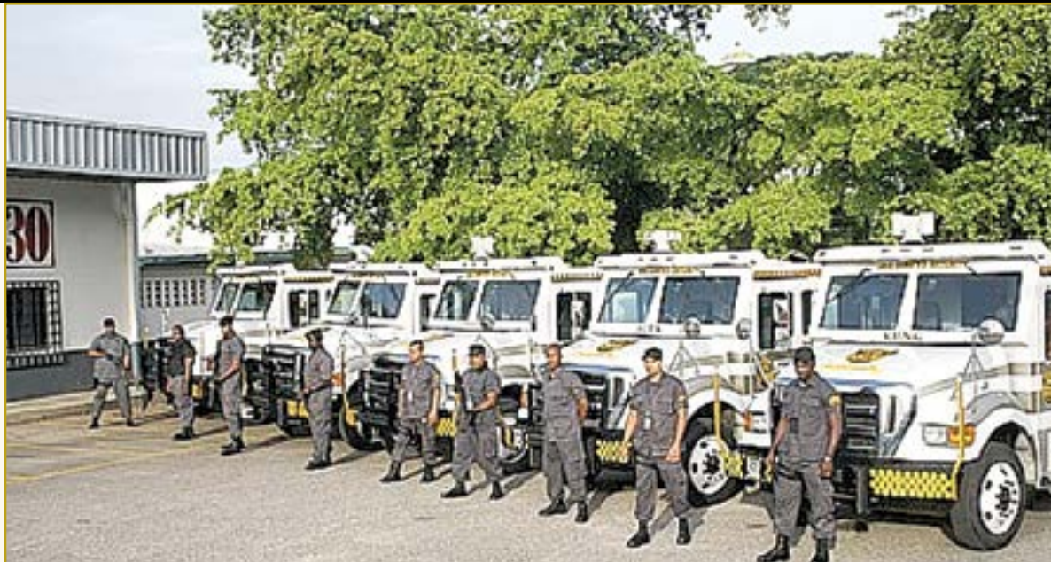
THE TEAM AT Amalgamated Security Services Limited is always ready to ensure your safety and security.